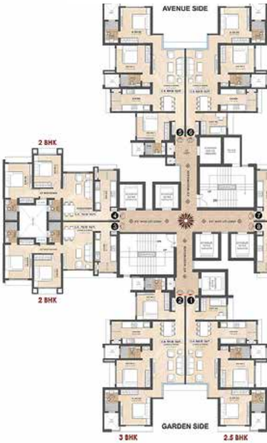
TOWER D TYPICAL FLOOR PLAN